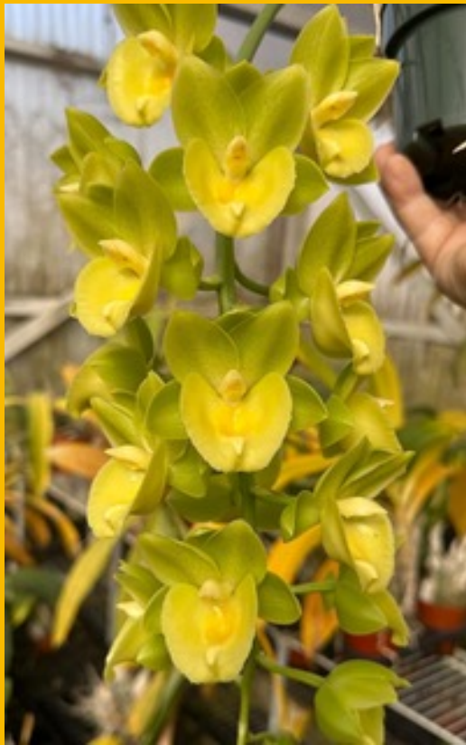
Fdk. Upgrade x Ctsm. Susan Fuchs