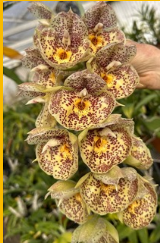
Ctsm. Orchidglade 'Davie Ranches' AMAOS