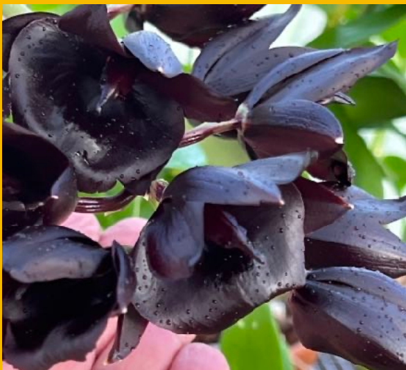
Monn. Millenium Magic 'Witchcraft' FCC/AOS

We want to encourage more of our members to step up and volunteer for additional positions highlighted above in bold . We ask individuals to consider working in a supportive capacity so the member can get an idea of what is involved and, hopefully, take over the responsibility in future years. This is particularly desirable for the positions of Co-president, Treasurer and Webmaster. Many of the current individuals have served in their capacities for several years and it would be desirable to have others to share the responsibility.