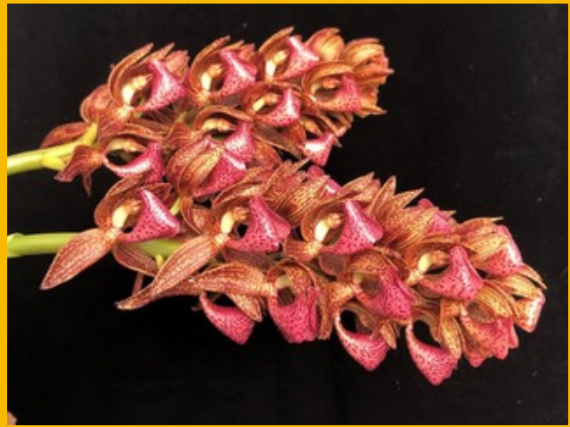
Morm. Wild Rainbow x Morm. Nitty-Gritty 'SVO'.