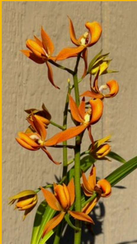
Morm. ignea x Morm. Aftermath) 'Orange'.